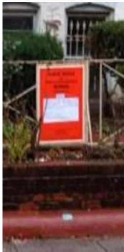
2. 12/23/22 – 18 th Street #2