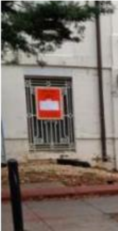
1. 12/23/22 – 18 th Street #1